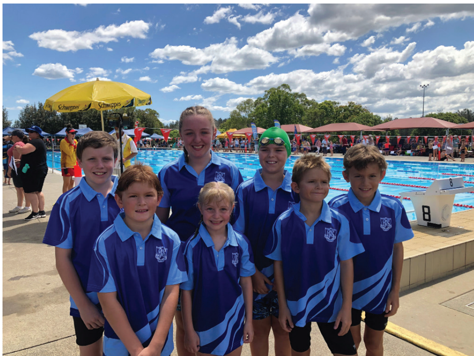
A proud member of the Bucketts Way Community of Schools