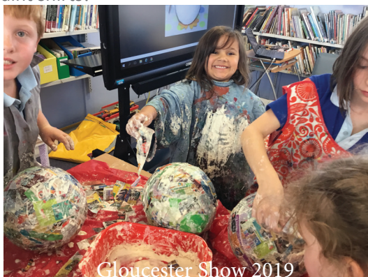
Gloucester Show 2019

Whilst these lessons take lots of preparation and clean up time, they are sooooo much fun and every kid needs to make paper mache sometime in their lifetime. Sorry parents for the slight mess on uniforms that sneakily managed to dodge the paint shirts!