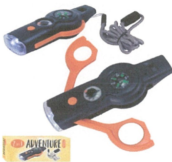
7 IN 1 ADVENTURE TOOL