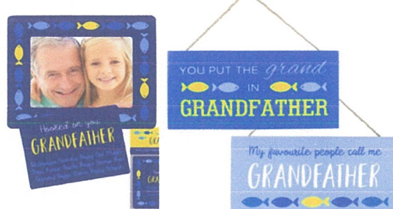
MAGNETIC FRAME AND HANGING PLAQUE