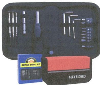
SUPER TOOL KIT