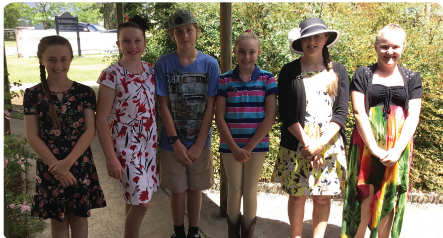
A proud member of the Bucketts Way Community of Schools

The year 6 organised a great day for Melbourne Cup. The activities ranged from jockey relay races, designing fascinators, fashions on the field catwalks and colouring jockey's uniforms. They raised $79.00 for their efforts and everyone enjoyed themselves.