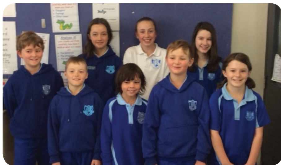
A proud member of the Bucketts Way Community of Schools